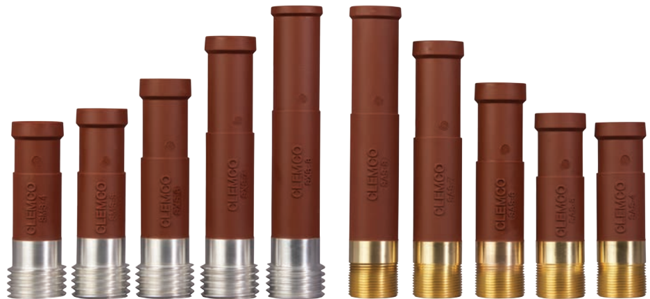
Aluminum Contractor Thread